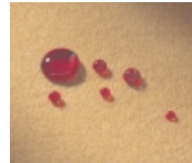
Treated with TEFLON® Fabric Protector